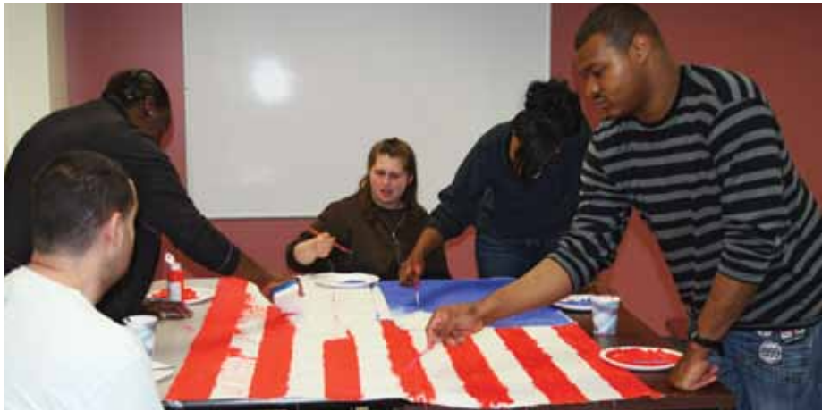
Staff and program participants collaborate on an art project.

includes the Center's new "upper campus" (featured in the Spring 2009 issue of @May). Whereas the upper campus was designed to meet the needs of students ages 16-22, the Day Hab program serves individuals ages 22 and older, providing vital adult services to individuals who have "aged out" of publicly funded special education services.