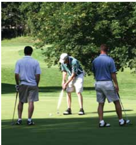
Teammates look on as one golfer prepares to sink his putt.

May Institute's Adult Services Division extends a warm thank you to those who supported its annual Summer Scramble Golf tournament in 2009. The event was held on a perfect summer day at Newton Commonwealth Country Club in Newton, Mass. Close to 100 golfers from across New England brought their best game, sharing in the competition, camaraderie, and satisfaction of supporting a good cause.